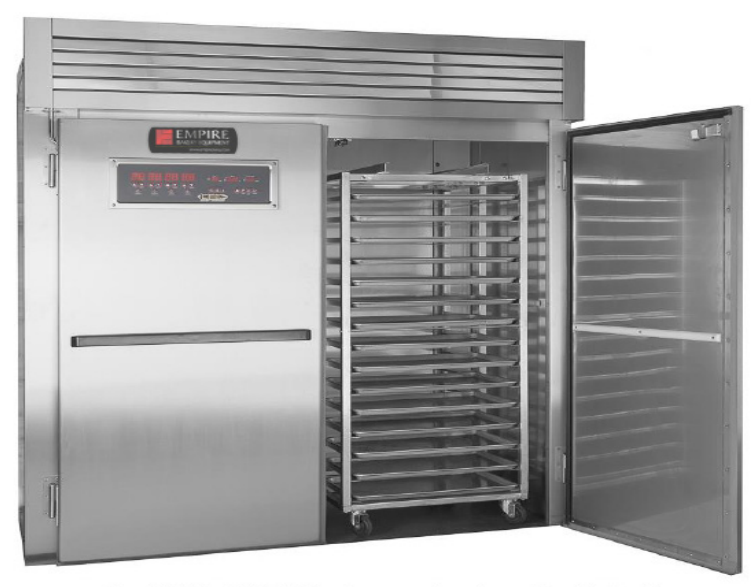
Model LRP2S-40 shown (rack not included)